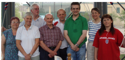
QP band at Basildon

The commemorative booklet has been compiled and is on its way to Clarence House, the couple's official London residence. Consider it a practice run for HM the Queen's Diamond Jubilee next year!