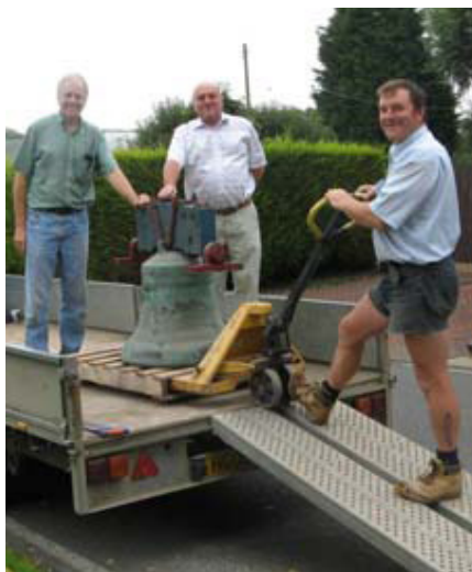
the "new" bell arrives