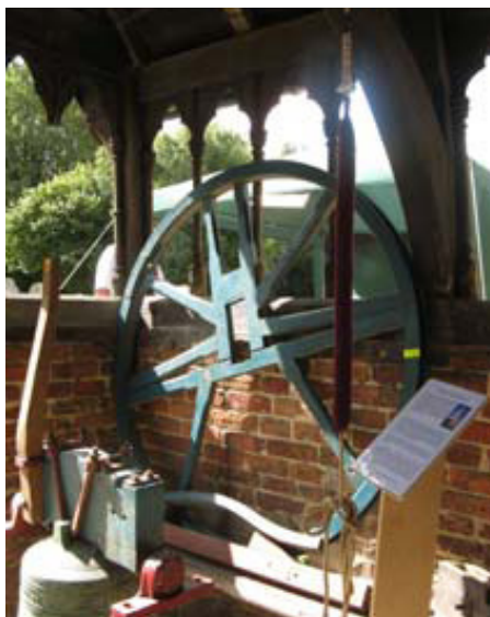
the bell on display

This gave people an opportunity to see a church bell and its wheel closeup and better understand how a bell "works". It was pleasing to see so many people interested enough to climb the tower and see the existing bells. And, a group visit in January to the Whitechapel Bell Foundry, where all the St. Christopher's bells came from, albeit one 400 years ago, is fully subscribed. The way we are going collectively the villagers of Willingale will be the most knowledgeable on bells in England. The news that St. Christopher's bells can be rung continues to spread around the ringing fraternity and another visiting band came in November.