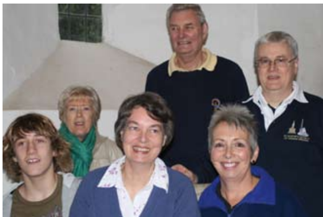
The bands were (all left to right)