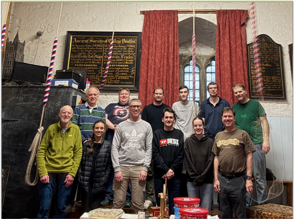
The band, clockwise from front right

to improve the acoustics and make them the super resource we have and make them somewhere where we can enjoy some excellent 12-bell ringing.